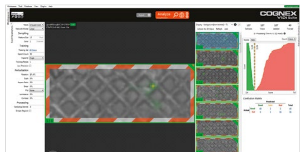
ViDi training interface