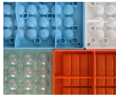
Various coloured sample moulds made of copolyester

The solution has already been successfully tested with BPA-free moulds . Therefore, the systems offer a high level of investment security even beyond 2027.